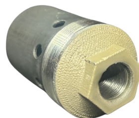
FREE 3D-Printed Titanium HUB Brake