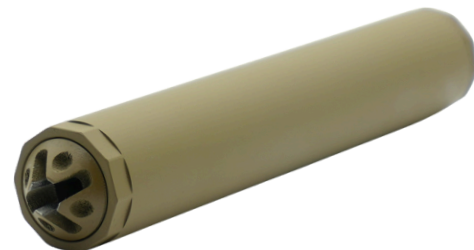
Lifesaver - Flat Dark Earth

Available in the following colors: Black, FDE, OD Green & Tungsten.